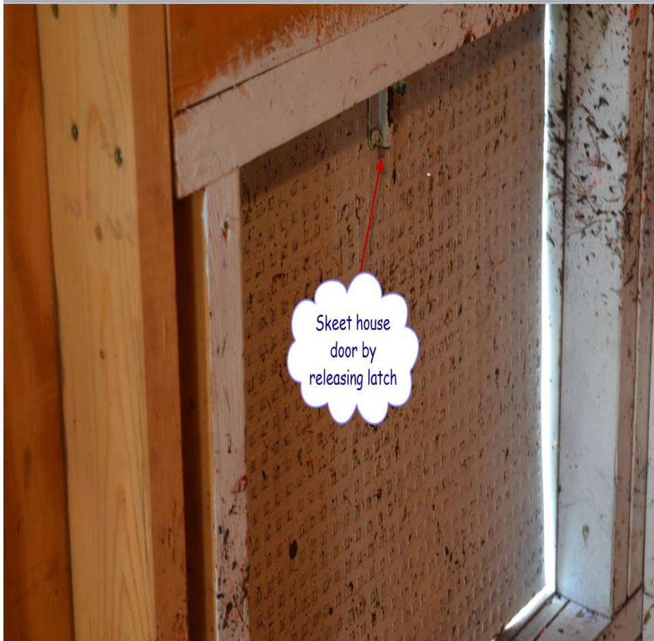
Skeet house door by releasing latch

Left picture inside, right picture outside looking in.