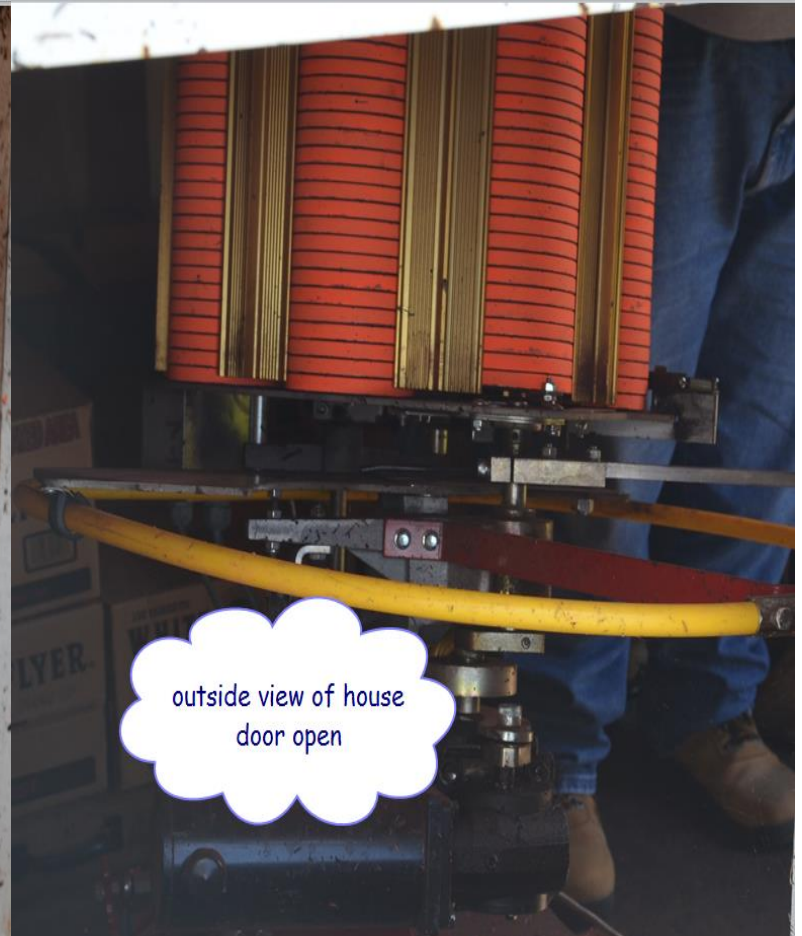
outside view of house door open